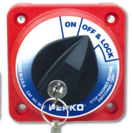
Fig. 9612 Disconnect Switch