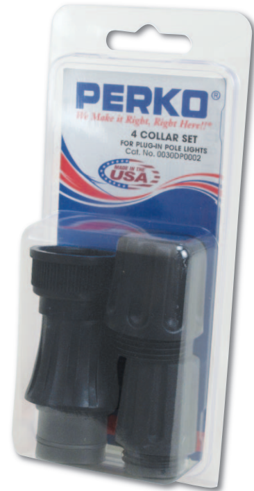
Fig. 0030DP0002 4 Collar Set