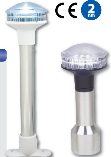
Fig. 1345 Fig. 1342