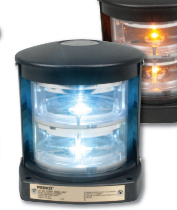
Fig. 1479 Stern Light