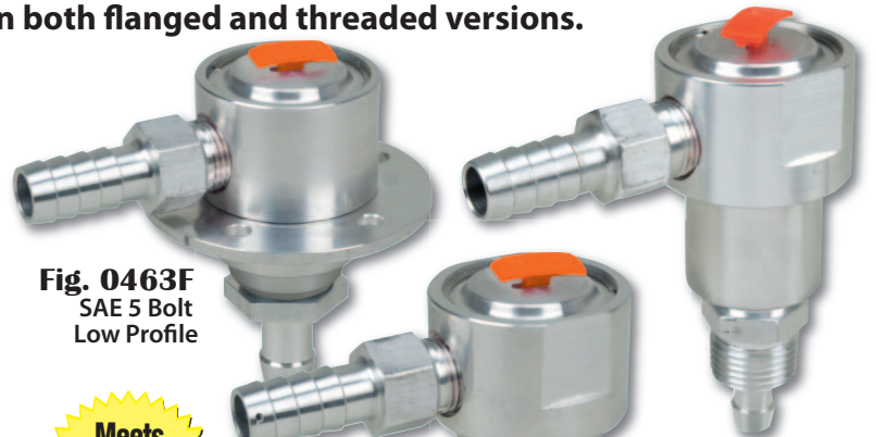
Fig. 0463F SAE 5 Bolt Low Profile